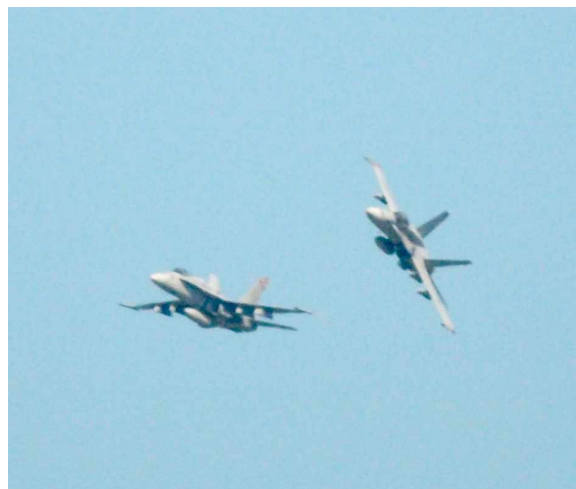
F18 Hornets training

July 10, Day 7: Ate breakfast at Blackstones – famous for breakfast of shrimp and grits with cheese. We made the 9:00 am opening of Ladies Island Bridge. This bridge does not open between 7:30 am and 9:00 am due to rush-hour traffic. It was a choice between making the 7:30 opening or having breakfast at Blackstones, and we decided that food was the priority. We passed by the Beaufort Marine Corps Air Station and were treated to an up close and personal air show of F-18 Hornets training.