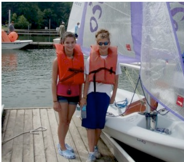
Enthusiastic new racers