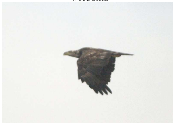
Immature Bald Eagle