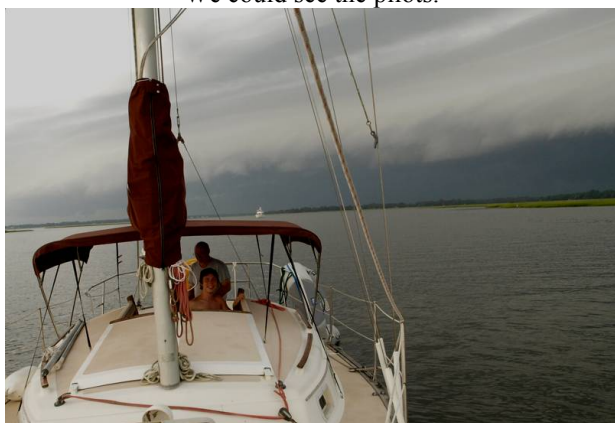
The first ominous storm approaches