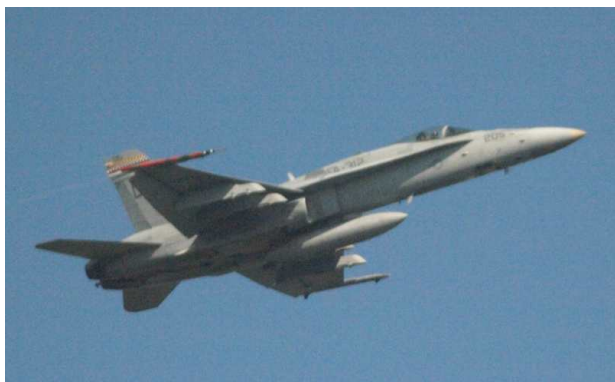
We could see the pilots.

We were heading towards an anchorage in Church Creek. As we got near the anchorage the typical afternoon thunderstorms started brewing. Shortly after we set anchor a very ominous wall cloud approached and the wind started to howl and whistle in the shrouds. I prayed that the anchor would hold while the wind pushed the boat one way and the current the other. By nightfall the weather had calmed down and we had a peaceful sleep under the stars. We were at ICW MM 488 and had traveled 46 miles for a total of 341 miles.