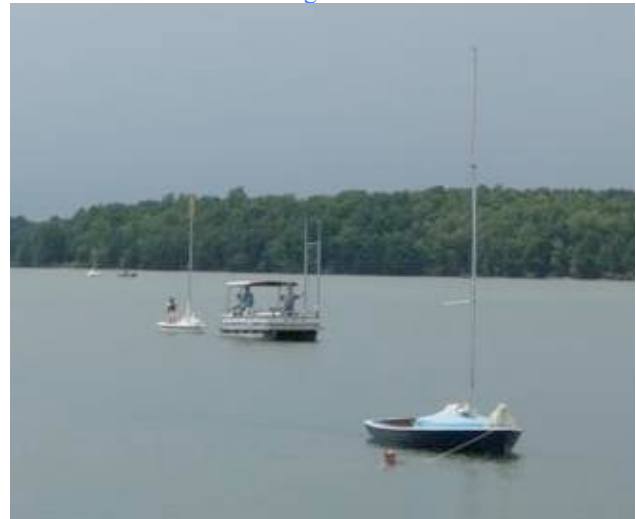
Bringing in the casualties

At the social, everyone was in great spirits. No one complained about race management or decisions. Everyone had a story to tell and was pleased to have survived the challenges of wind and waves.