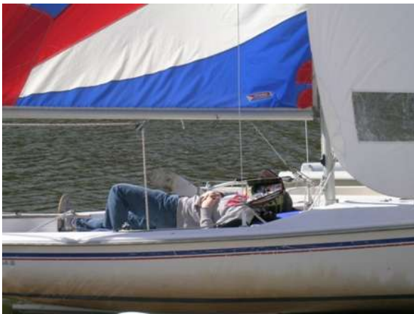
(It is essential to be mentally rested before racing.)

This was a gorgeous fall day – it started cool and was predicted to warm up. The sun was to be out.