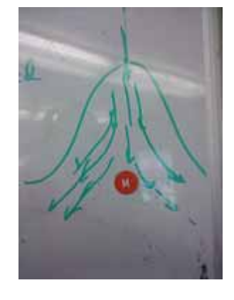
Mystery Cove Vortex