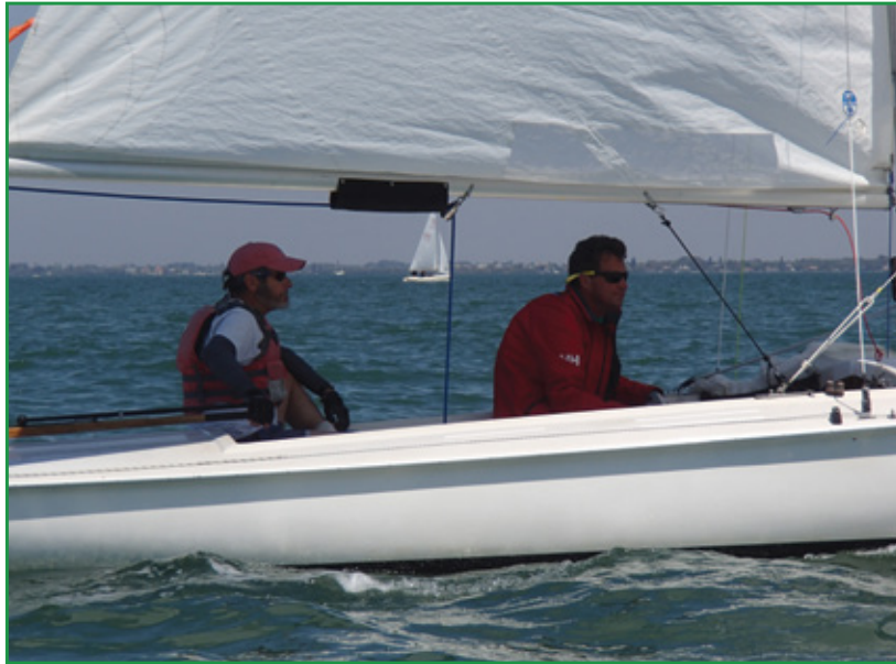
Flying Scott Midwinter Championship