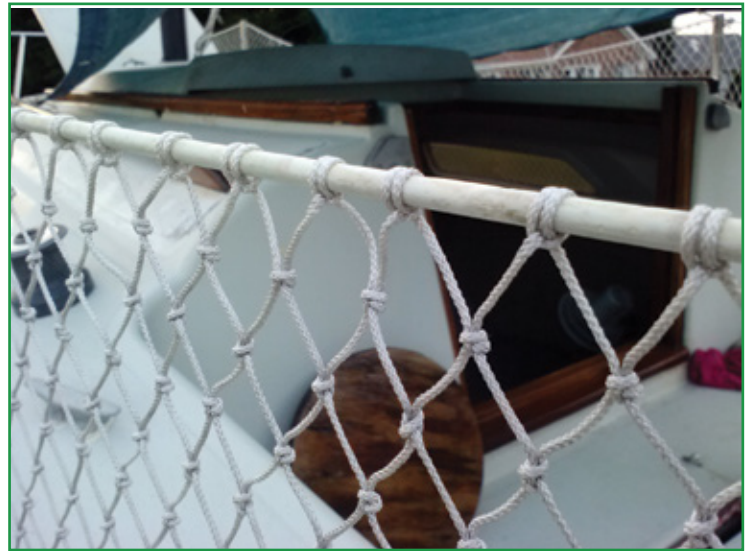
June Learn To Sail class