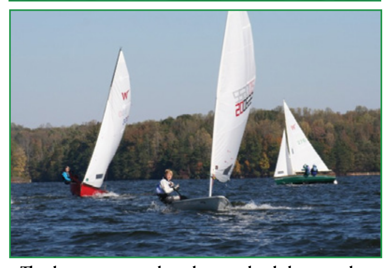
Thanks to everyone who volunteered to help out and to everyone who contributed to help Earlier.org. Mark your calendar now - last weekend in October 2014.

Halloween on the Townsend II is over. Money is still coming in to this great event that is put on by the members of the Lake Townsend Yacht Club. Final tabulations should be just over $4000 for Earlier.org. If you did not get a chance to participate in this fund-raiser, t-shirts are still available and donations are still being accepted. Make all checks payable to Earlier.org (tax-deductible).