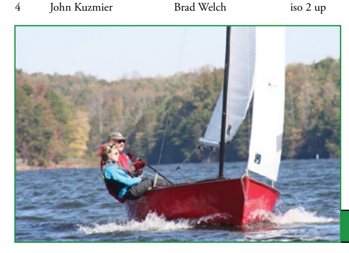
HOT II