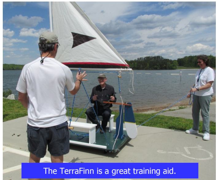
The TerraFinn is a great training aid.