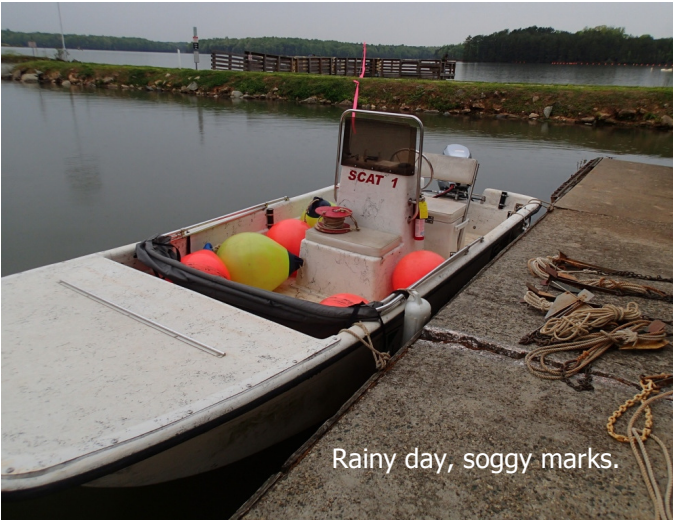
Rainy day, soggy marks.