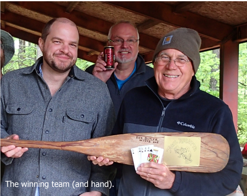
The winning team (and hand).