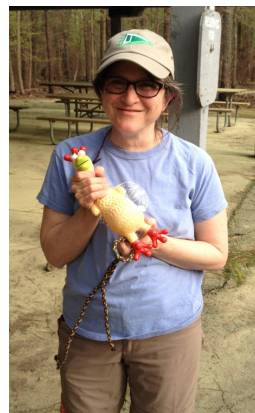
The rubber chicken came home to roost. Next year...!