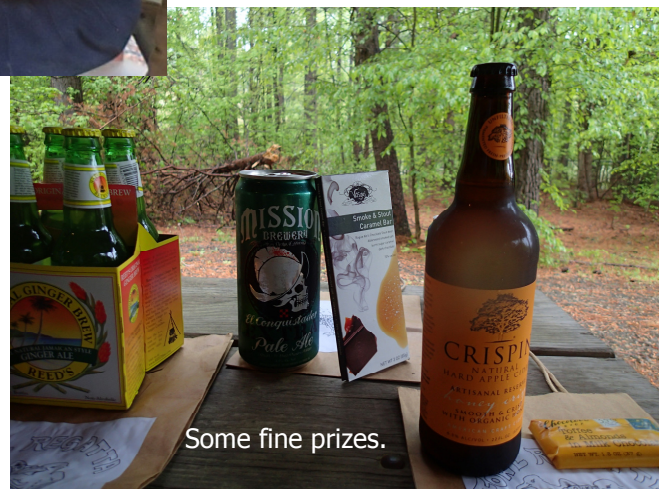
Some fine prizes.