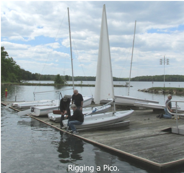
Rigging a Pico.