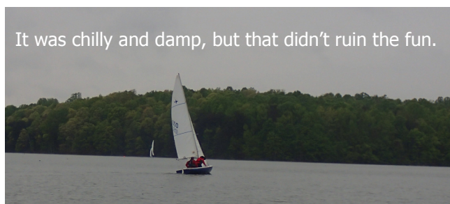
It was chilly and damp, but that didn't ruin the fun.