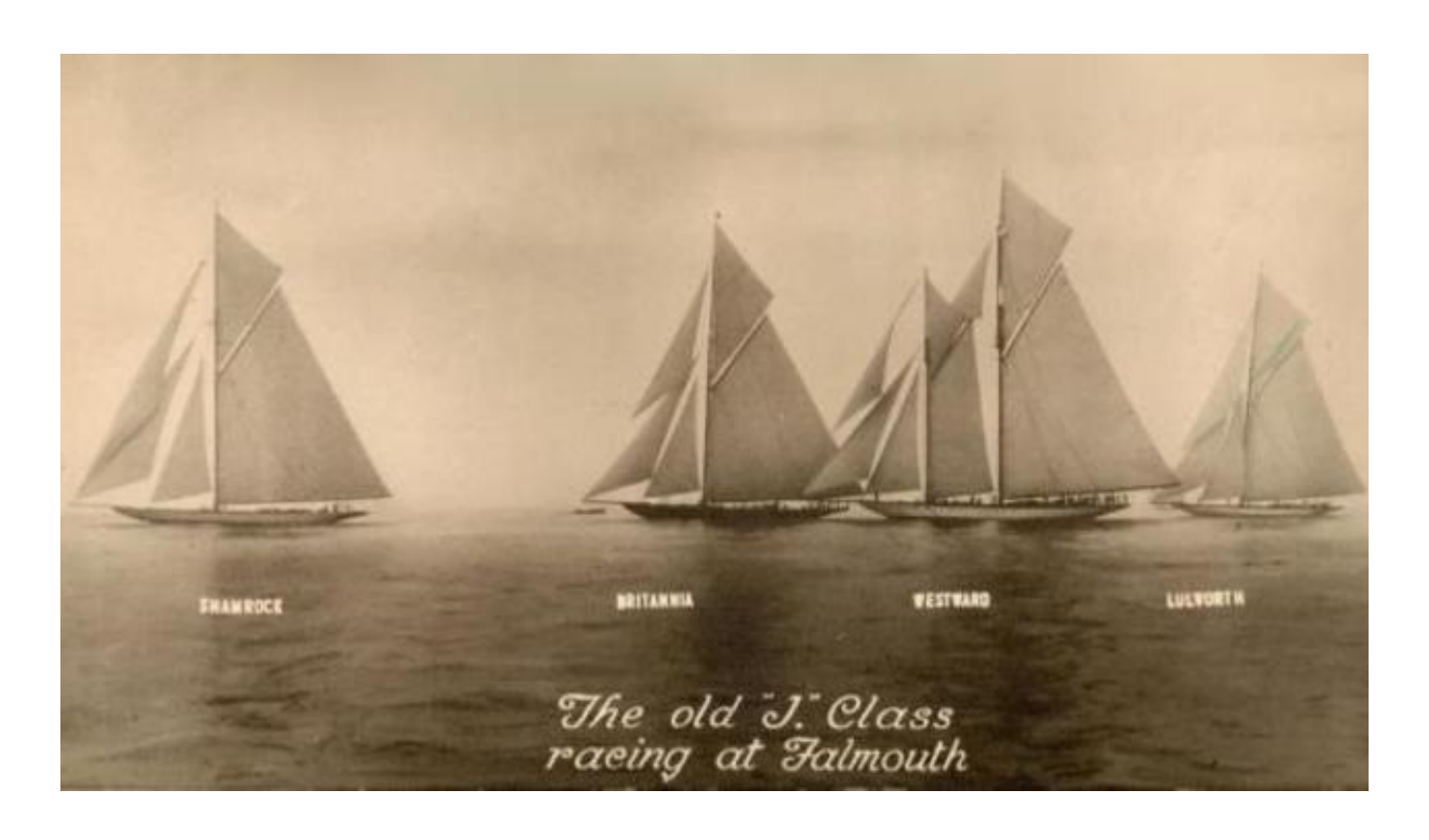
75 to 87 feet at the waterline, 125 feet +/- overall, about 7500 square feet of sail!