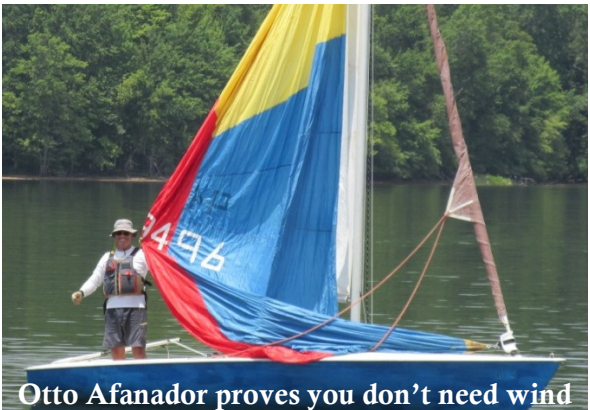
to fly a spinnaker!