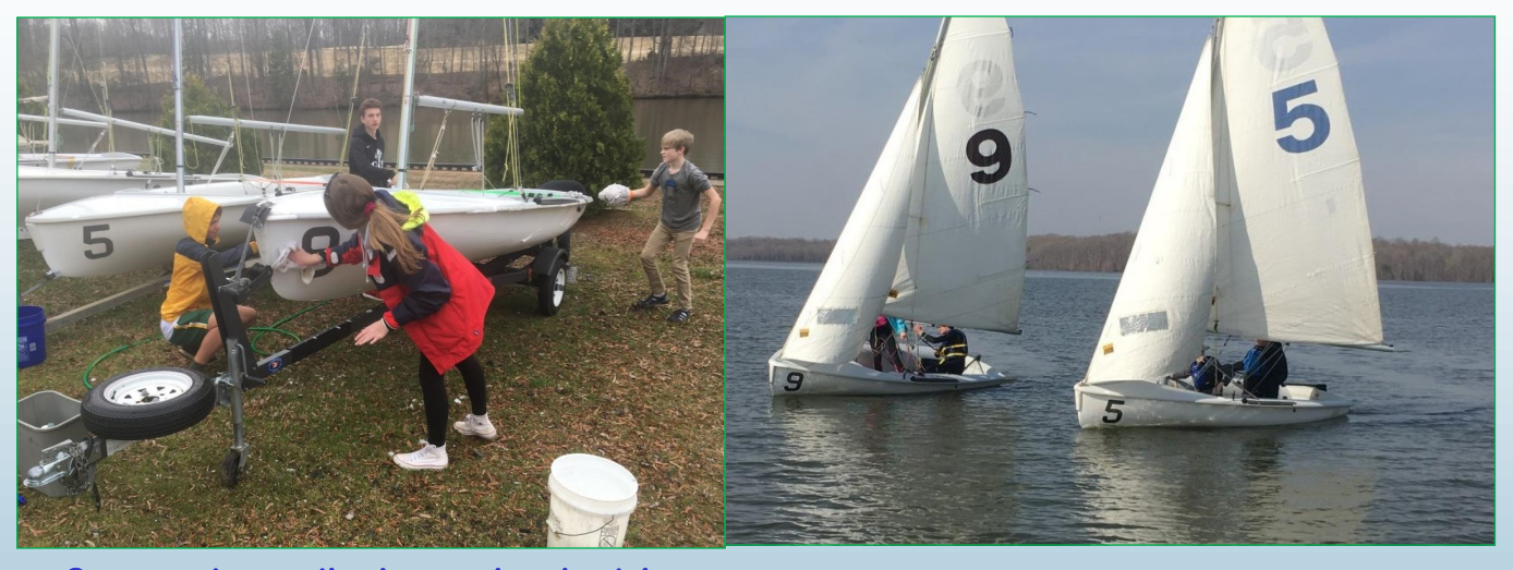
Soap + water + enthusiasm = clean boats!

Please follow us on Instagram at ltycsailingteam, and of course, on facebook at www.facebook.com/laketownendyachtclub/