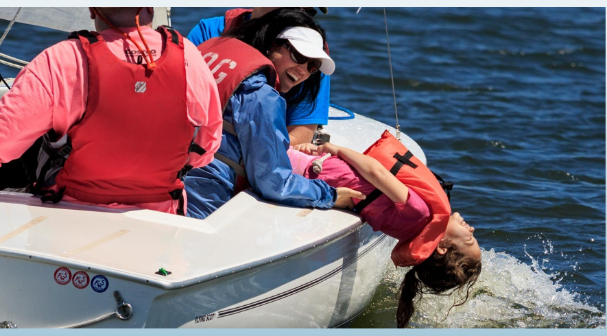
Continued on page 6