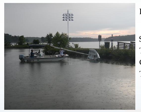
Left: An Evening Storm Blew Two Picos & Cradles Off The Dock.

Rounding The Mark Requires Teamwork on Larger Boats