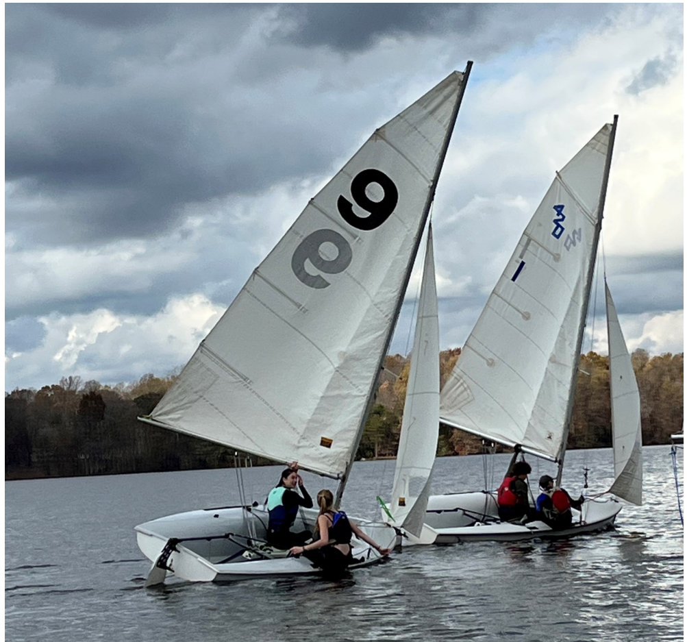
Close action at the November Winter Series