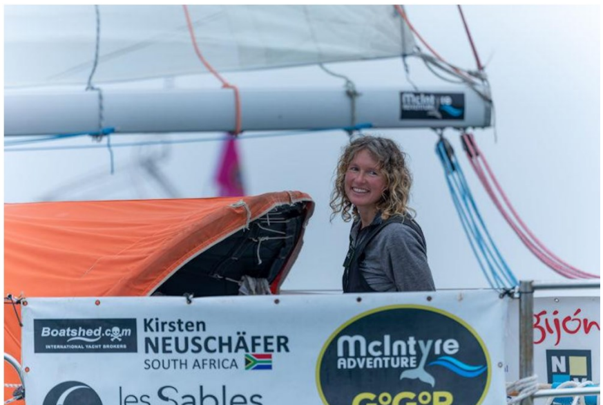
Kirsten Neuschäfer wins the Golden Globe Race 2022

At 40 years of age, the South African Kirsten Neuschäfer completed an eight-month long journey, alone in the face of the elements, without contact, collecting rainwater to survive.