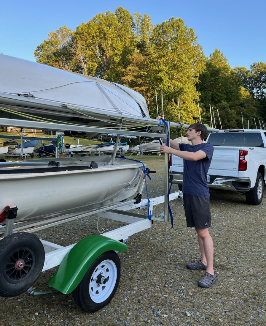
Prepping for the trip to Lake Norman to attend the North Points regatta