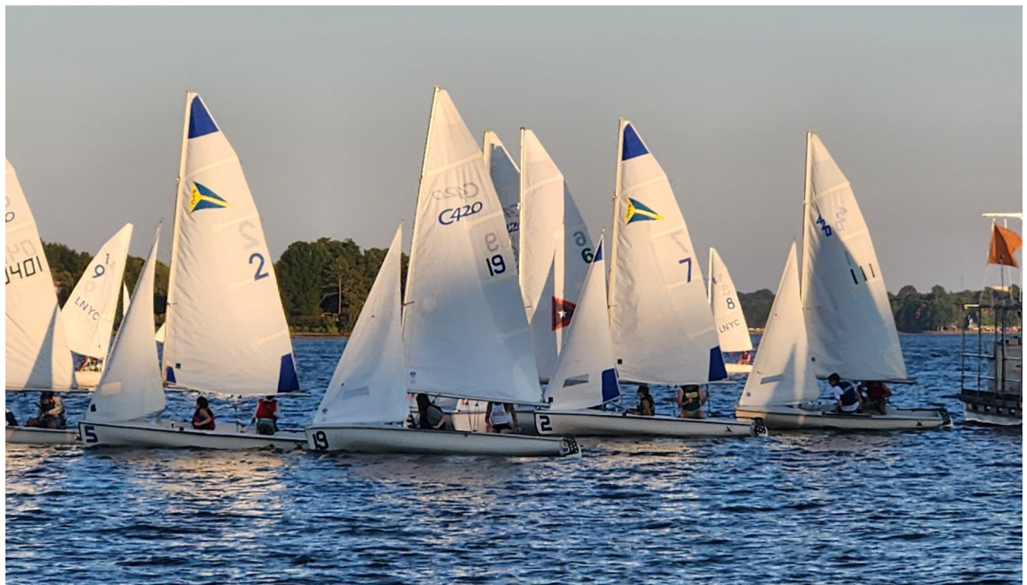
One of the starts at the North Points regatta at Lake Norman on Sep 30