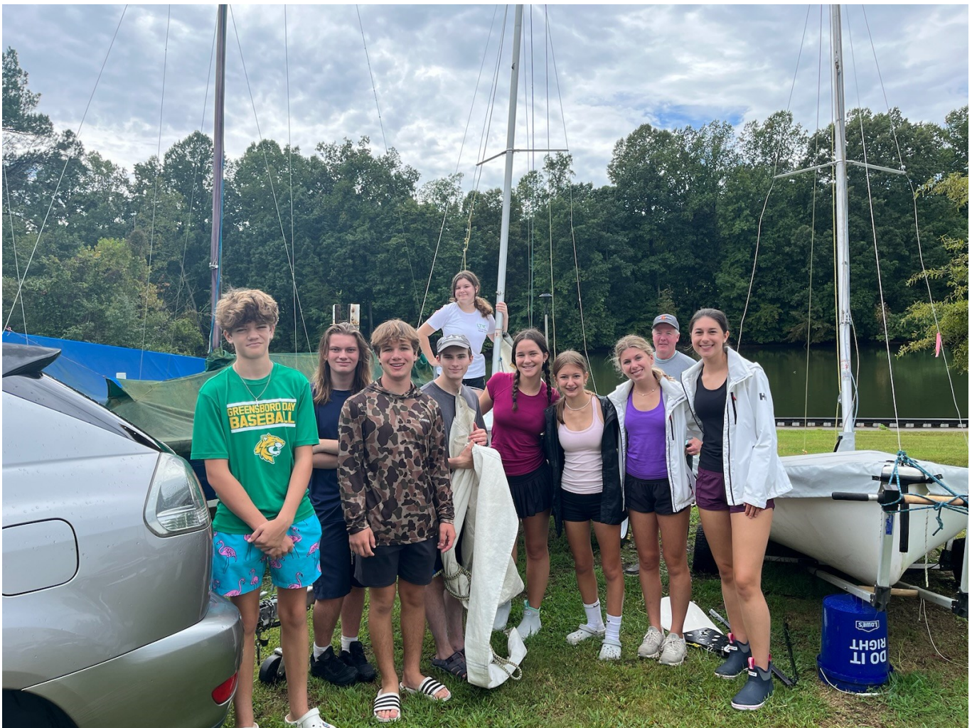
The High School Sailing Team

To get to the regatta, a new trailer was purchased and the team came together to repaint the trailer to LTYC colors and build a rack for two boats and masts. The trailer towed well and looks good at the same time. We are not ready for the 3 more North Points regattas we are planning on attending this season, so the timing of the purchase and build came together well. Thanks to everyone for the help and congrats to the team for the first North Points regatta!