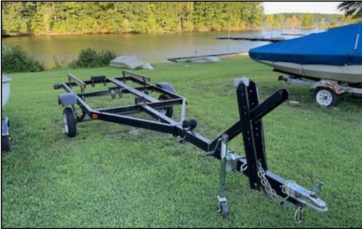
Started with a used Flying Scot trailer