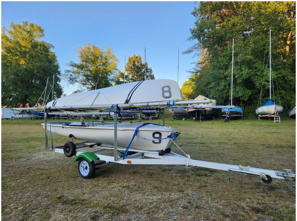
The finished product, modified to accommodate two boats and painted with an LTYC color scheme