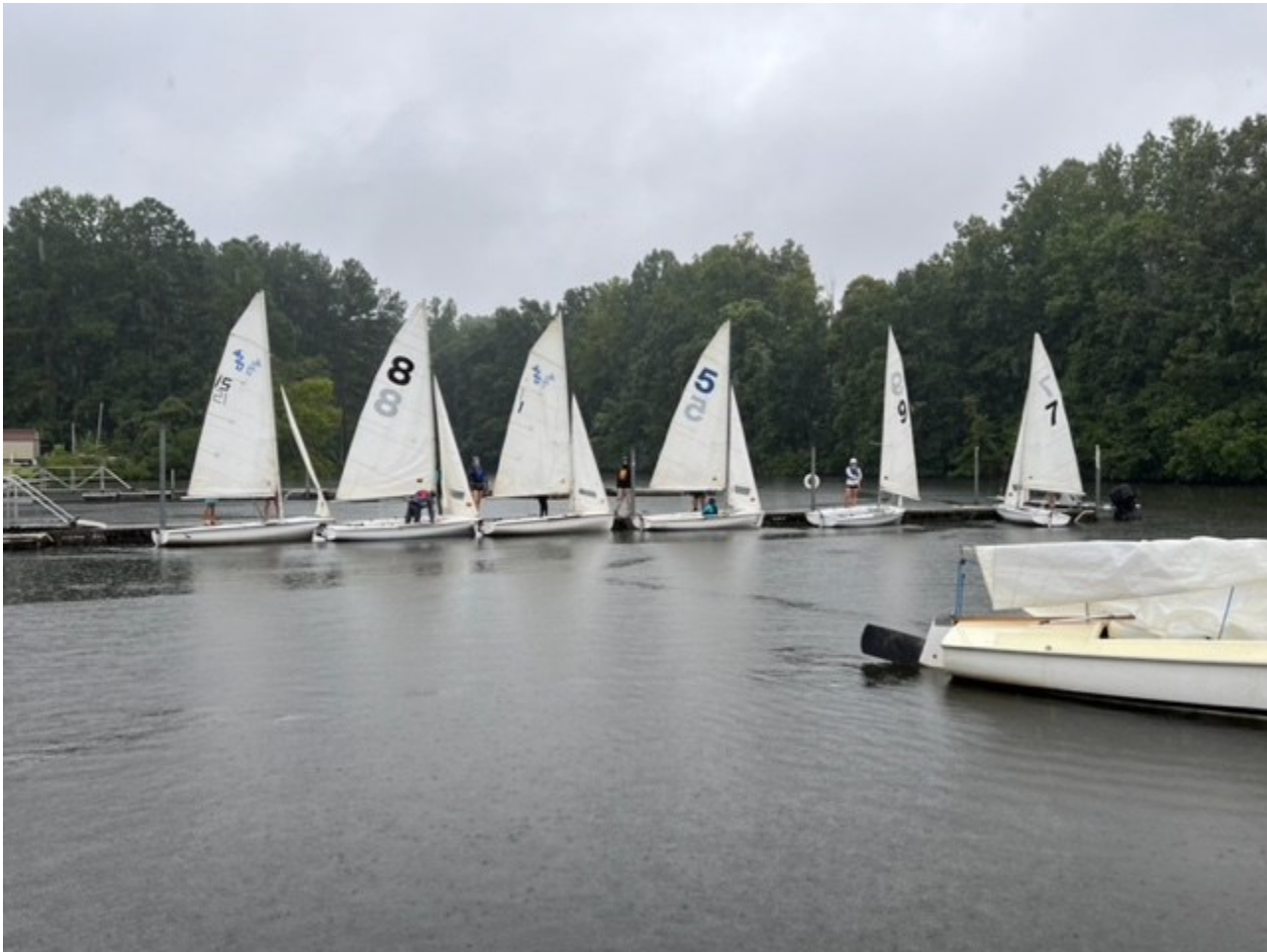
High School Sailing Team rigged and ready to go!

We had good wind all day, but called it after 2 windward/leeward races because the race committee (including myself) was cold and wet! LOL