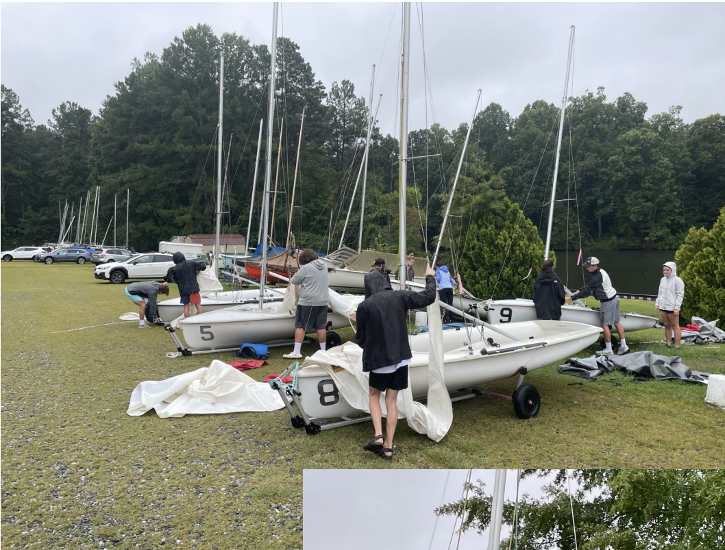
Putting the boats up wet.