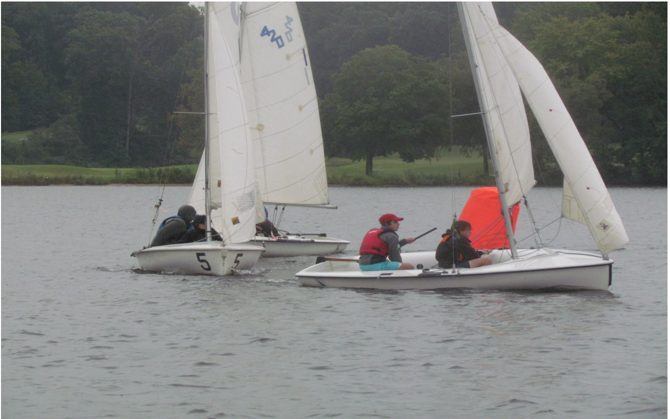
Close Mark Rounding