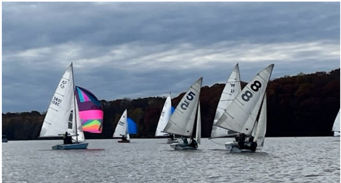
LTYC High School Sailing Team (sail #5 and sail #8) competing in our Fall Series opener—Turkey Day races