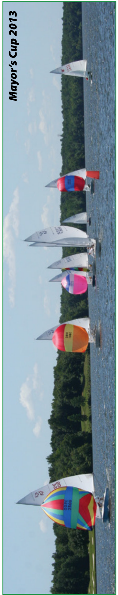
Mayor's Cup 2013