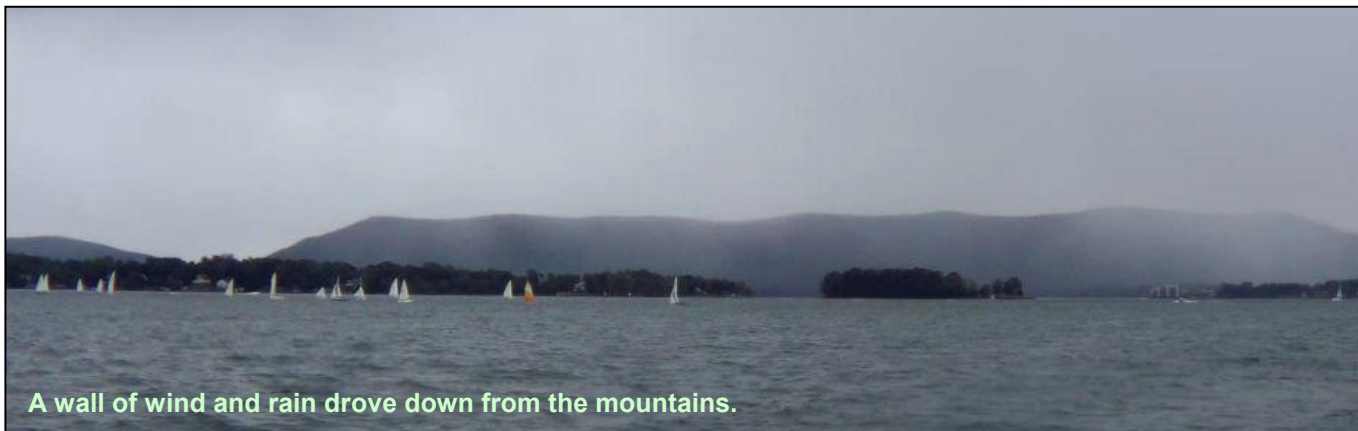
A wall of wind and rain drove down from the mountains.

Sunday's weather was predicted to be 100% chance of rain, but the rain held off and racing continued, with the regatta's races 1 and 5 being cancelled due to lack of wind.