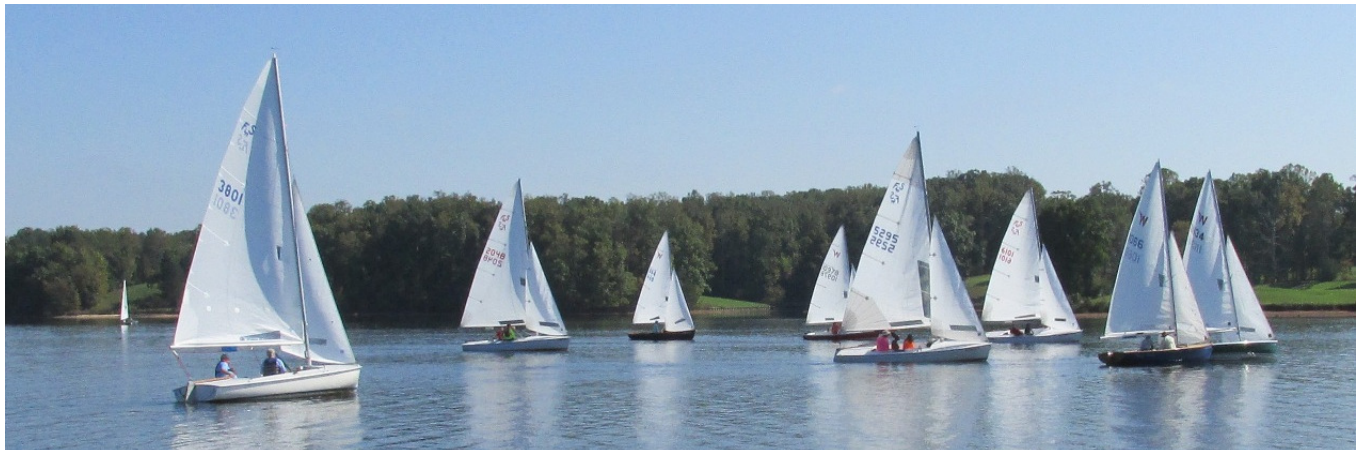
The fleet gets a good clean start.